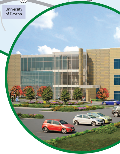
Construction on Tech Town's second building is expected to be completed by the summer of 2011.

Learn more! Call (937) 853-2539. www.daytontechtown.com