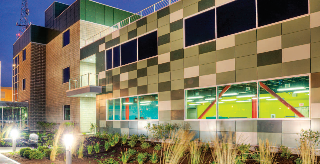
Tech Town's buildings are designed with cutting-edge infrastructure, establishing the district as an innovative leader from the outside in.